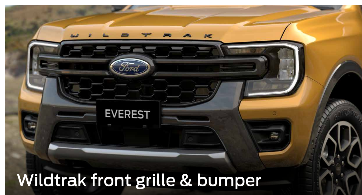
Wildtrak front grille & bumper