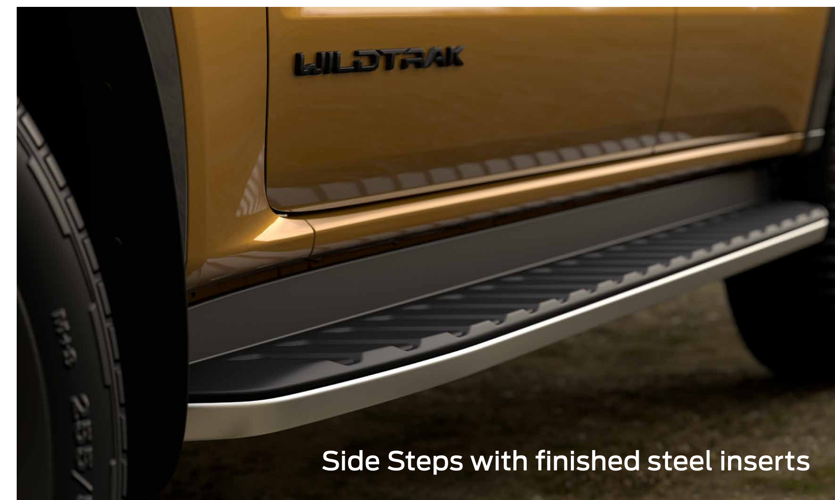
Side Steps with finished steel inserts