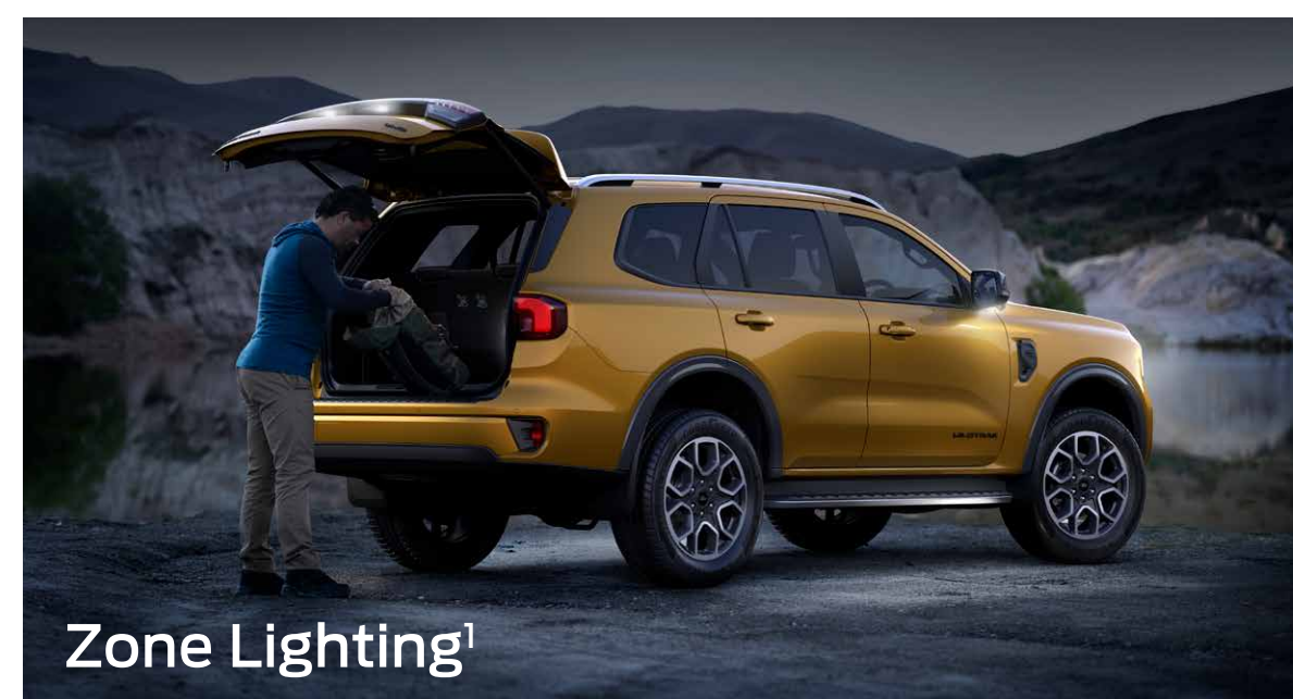
Zone Lighting 1