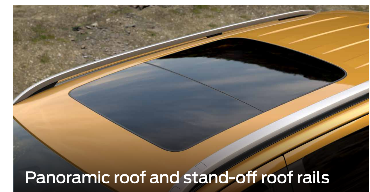
Panoramic roof and stand-off roof rails