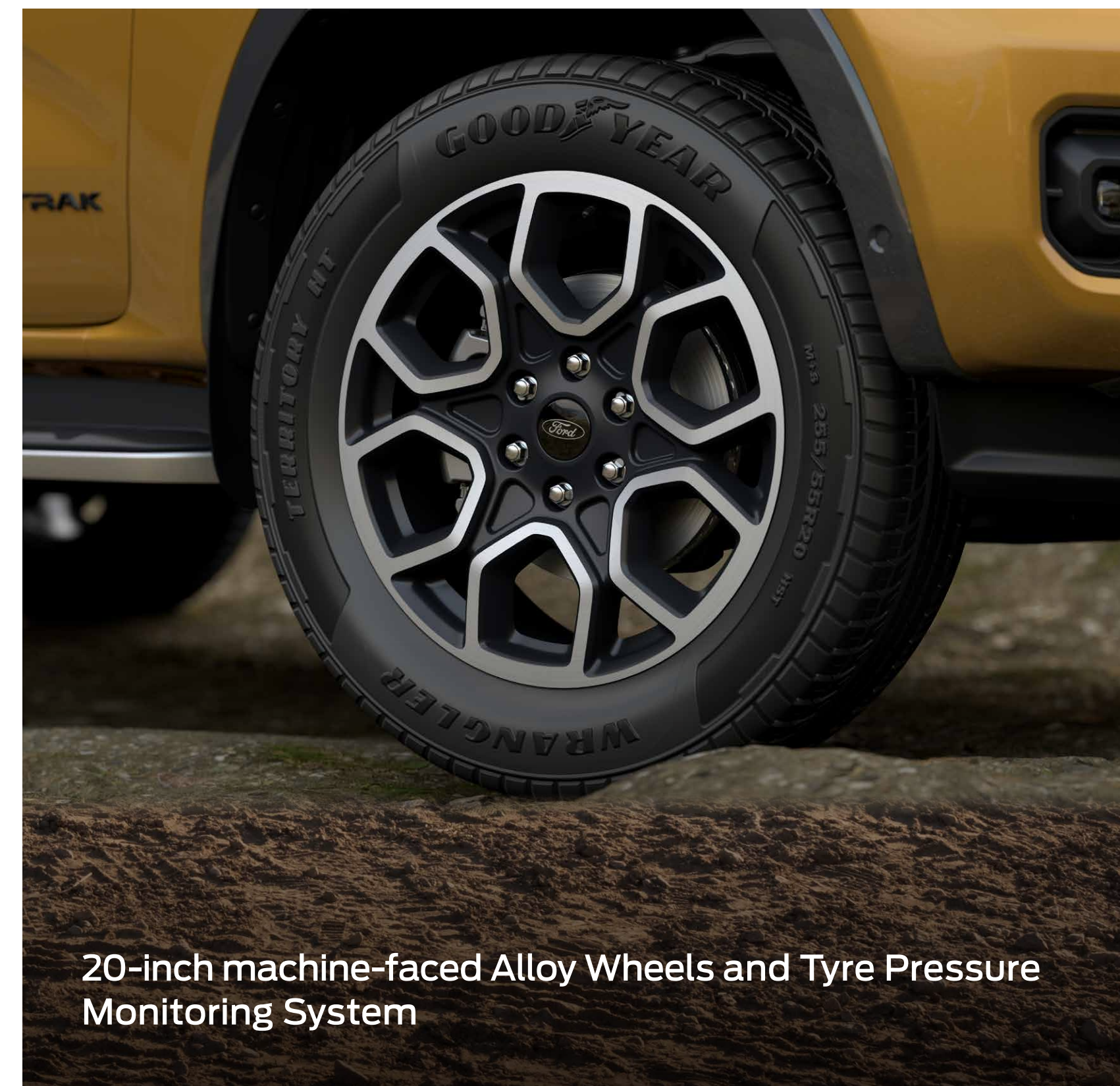
20-inch machine-faced Alloy Wheels and Tyre Pressure Monitoring System

The 3.0L V6 4 engine is paired with the help of 6 drive modes 2 – Normal, Eco, Tow/Haul, Slippery, Mud/Ruts 5 and Sand 5 to help you conquer any terrain.