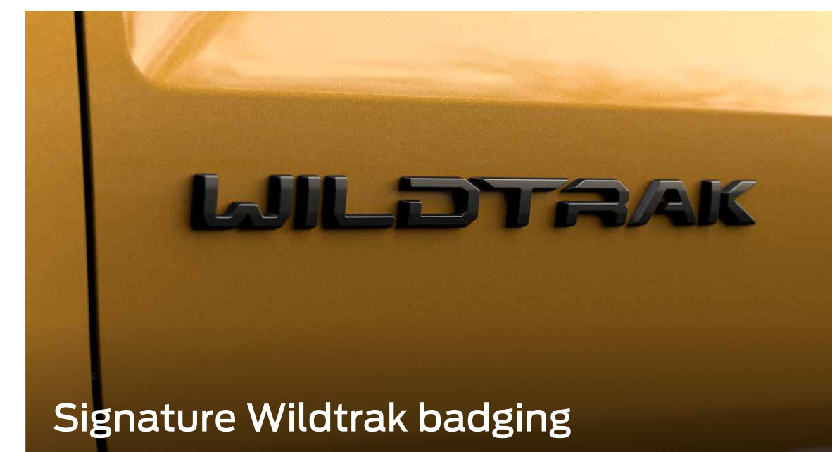
Signature Wildtrak badging