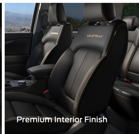
Premium Interior Finish