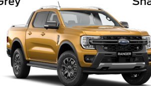
Luxe Yellow #

* Blue Lightning not available on Wildtrak models. # Luxe Yellow only available on Wildtrak models.