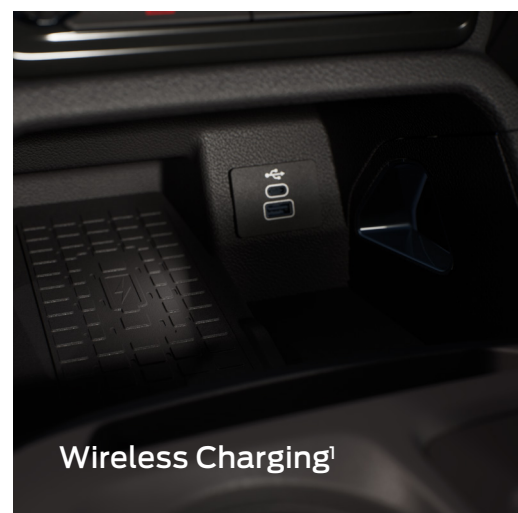
Wireless Charging 1

* Blue Lightning not available on Wildtrak models. # Luxe Yellow only available on Wildtrak models.