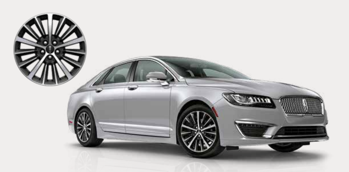
18" 5-SPOKE MACHINED ALUMINUM WITH PREMIUM PAINTED POCKETS MKZ