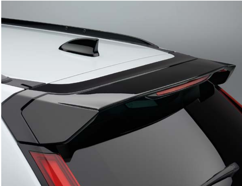
TAILGATE SPOILER Add some extra sportiness to your CR-V with the tailgate spoiler, which complements the lines of the roof and rear of the car.