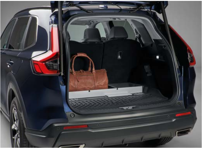
BOOT TRAY WITH DIVIDERS This waterproof anti-slip boot tray is perfectly shaped to fit your car's rear storage space and will protect the boot from dirt and scratches. Comes with dividers to help secure your items while driving.