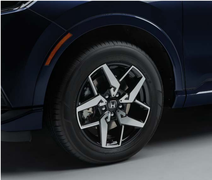
Model shown is the Honda CR-V e:HEV Advance 2.0 i-MMD in Canyon River Blue Metallic with optional 18" alloy wheels CR1811.