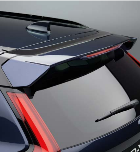
TAILGATE SPOILER The body-coloured tailgate spoiler complements the lines of the roof and accentuates the sporty styling.