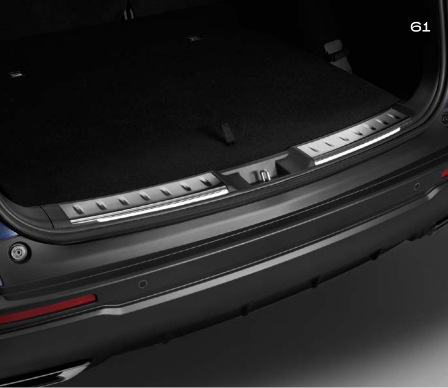
ILLUMINATED BOOT SILL DECORATIONS Protect the boot sill by fitting this stainless steel boot sill trim. It features illumination when opening the boot lid to help with visibility at night.