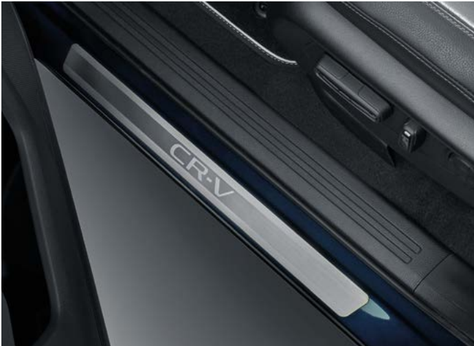
DOOR SILL TRIMS The door sill trims add a personal touch to your car while protecting the door sills from marks and scratches. Crafted in stainless steel, they also have an eye-catching CR-V logo. Includes: front and rear trims.