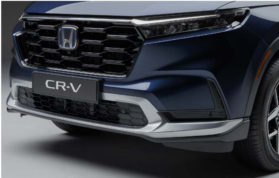
FRONT AERO BUMPER Enhance the dynamic and premium style of your CR-V with this distinctive front aero bumper.

The pack includes: a front aero bumper, a rear lower bumper, door mirror covers and side skirts, all finished in Lunar Silver complemented by a body-coloured tailgate spoiler.