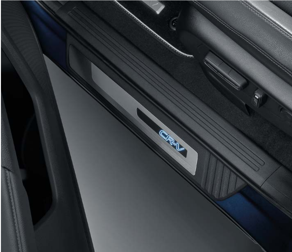
ILLUMINATED DOOR SILL TRIMS Add an extra touch of style to your CR-V's interior with the illuminated door sill trims. The stainless steel finish glows with a CR-V logo for sleek lighting when you open the door.