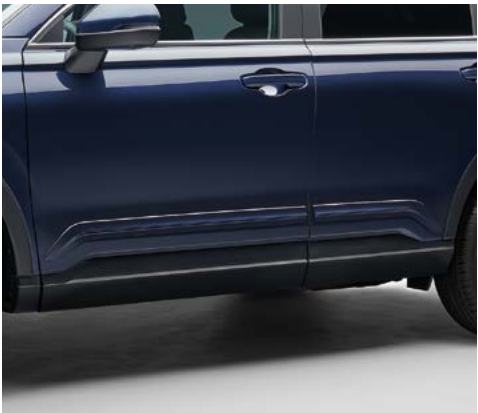
SIDE BODY TRIMS IN BODY COLOUR Protect your car from dents while being parked with these side body trims. They keep your paint safe, while retaining the lines of your CR-V.

A practical pack to make your CR-V the ideal companion on your trips! The all-season mats and boot tray with dividers are handy for autumn and winter, while the door sill trims and side body trims protect your car's paint against dents and scratches.