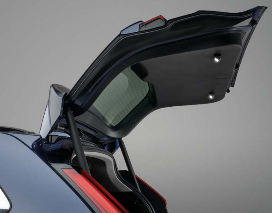
TAILGATE ILLUMINATION The tailgate illumination has been developed to increase your comfort and safety by illuminating not only the boot, but also the area behind your car. The LED lights installed on the inside of the tailgate provide a powerful and consistent light in the boot, even when fully loaded.