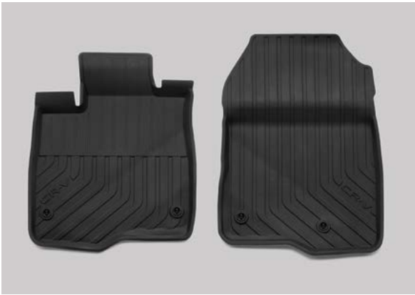
FRONT AND REAR ALL-SEASON MATS These all-season mats with raised edges are made to protect the entire footwell and feature the CR-V logo. They are tough yet easy to clean. The kit includes: two front and two rear mats.