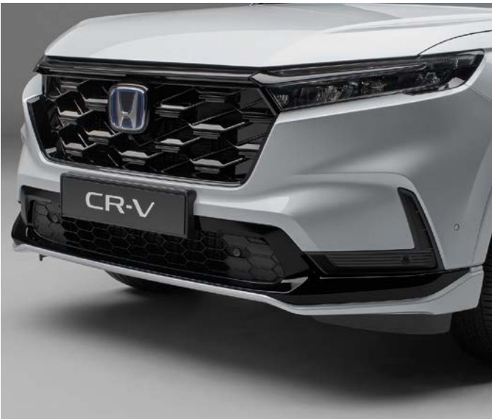
FRONT AERO BUMPER Enhance the dynamic look of your car with the front aero bumper. Featuring a body colour and Berlina Black colour combination to give the bumper area a premium feel.