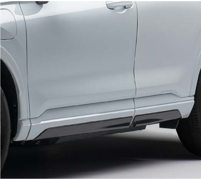
SIDE SKIRTS Give your car an exciting and sporty profile by adding these side skirts.