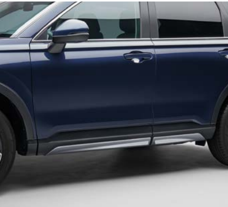
SIDE SKIRTS Give your car an exciting and sporty profile with these stylish and sleek side skirts.