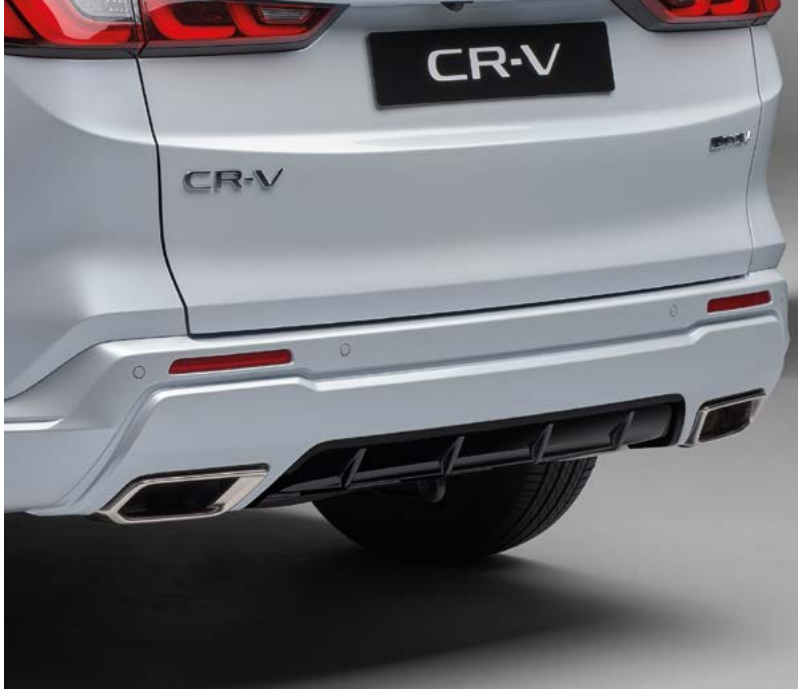
REAR LOWER BUMPER Complete the look of your CR-V with this rear lower bumper in a body colour and Berlina Black colour combination. It blends in perfectly with the front aero bumper and side skirts.

The pack includes: a front aero bumper, a rear lower bumper, a Berlina Black tailgate spoiler and Berlina Black side skirts.