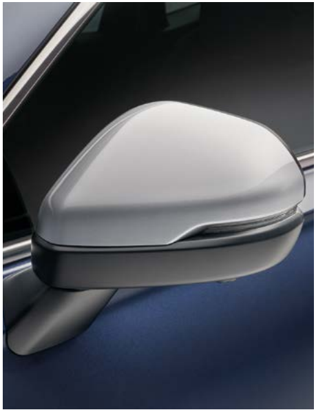
DOOR MIRROR COVERS Add a little individuality with these smart door mirror covers, designed to fit your CR-V seamlessly.