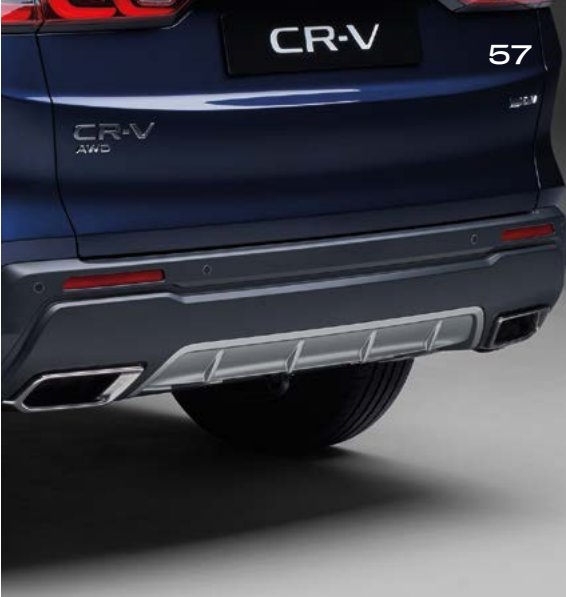
REAR LOWER BUMPER This rear lower bumper perfectly complements the front aero bumper and side skirts, completing the sporting look.