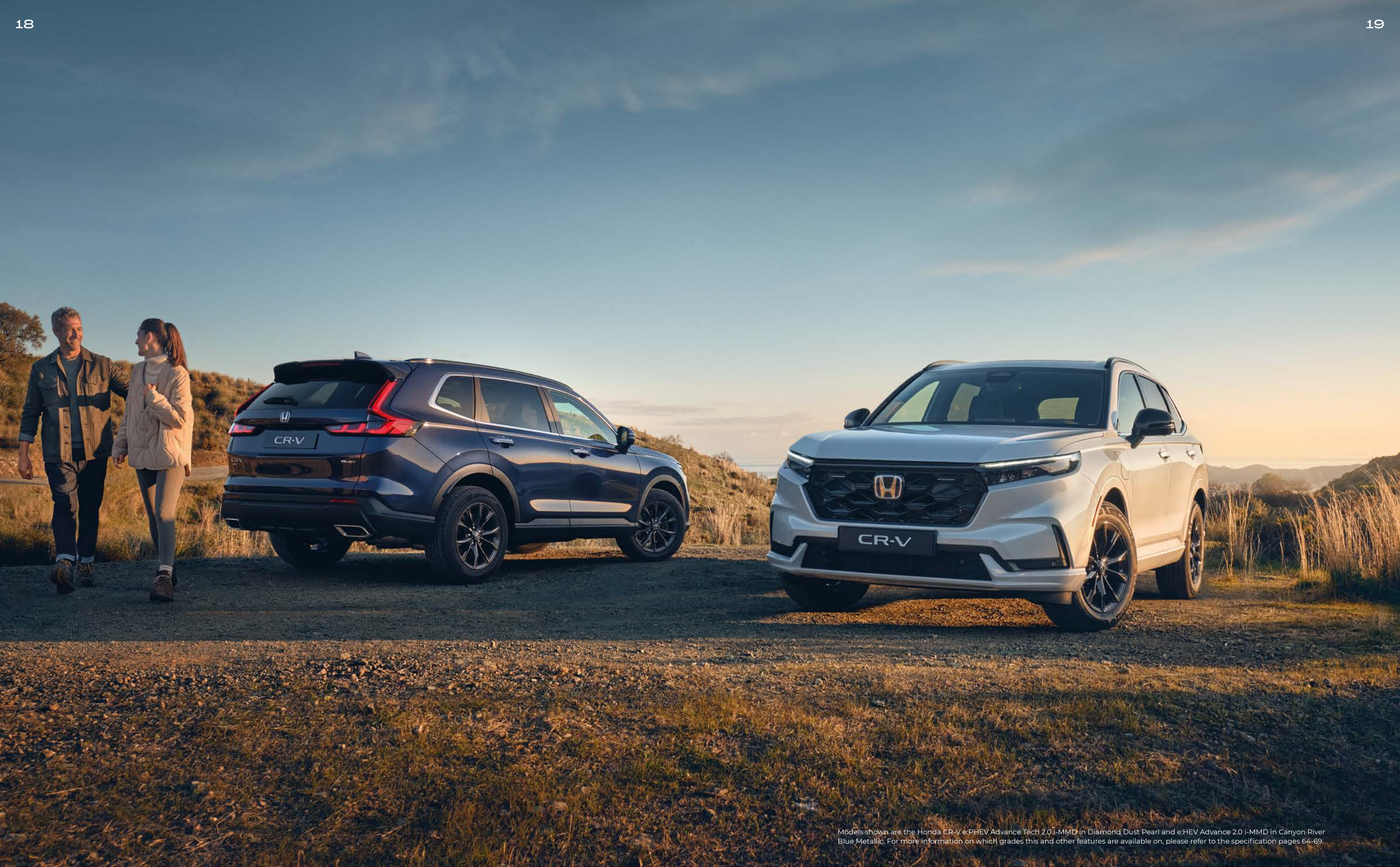
Models shown are the Honda CR-V e:PHEV Advance Tech 2.0 i-MMD in Diamond Dust Pearl and e:HEV Advance 2.0 i-MMD in Canyon River Blue Metallic. For more information on which grades this and other features are available on, please refer to the specification pages 64-69.