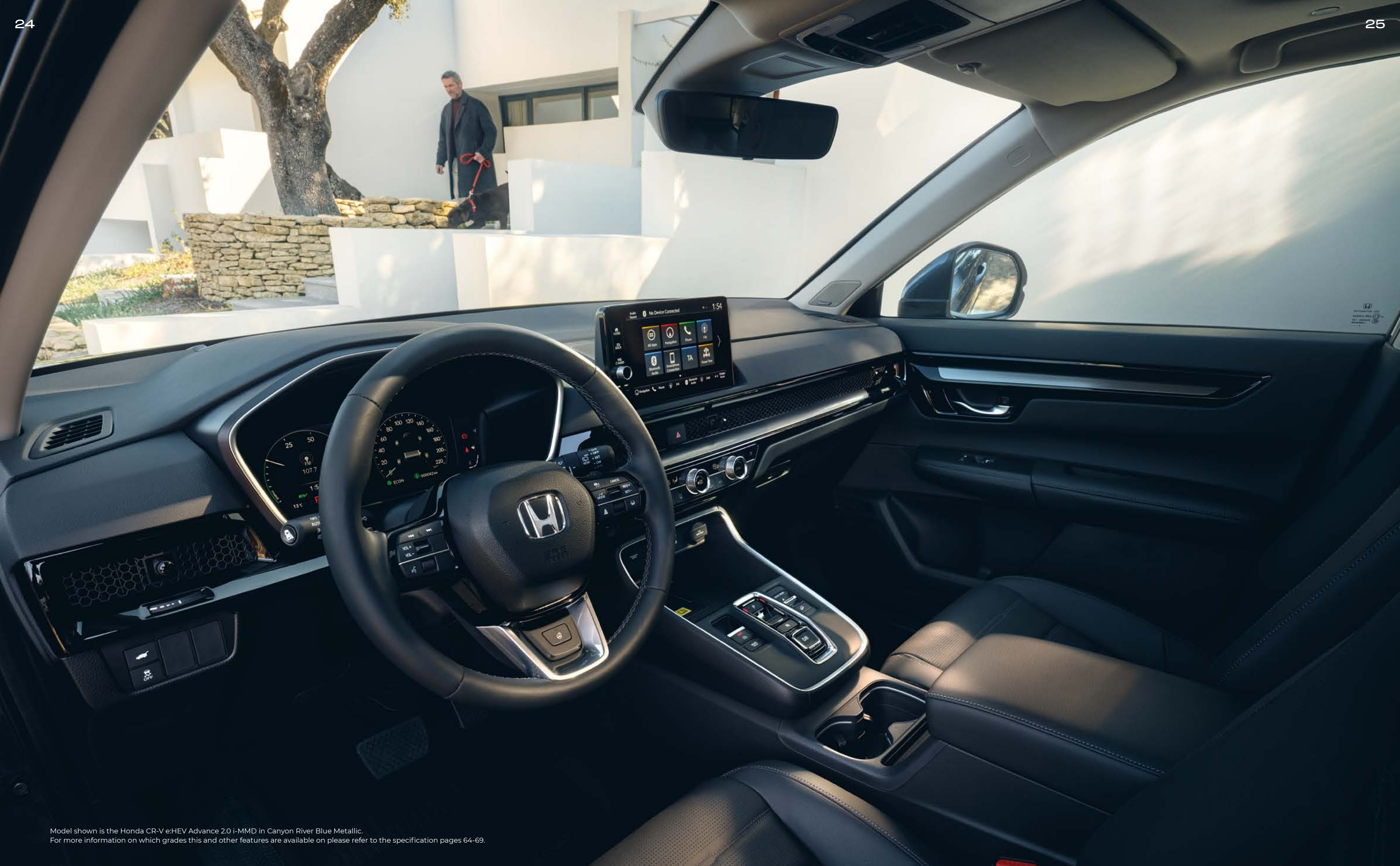
Model shown is the Honda CR-V e:HEV Advance 2.0 i-MMD in Canyon River Blue Metallic. For more information on which grades this and other features are available on please refer to the specification pages 64-69.