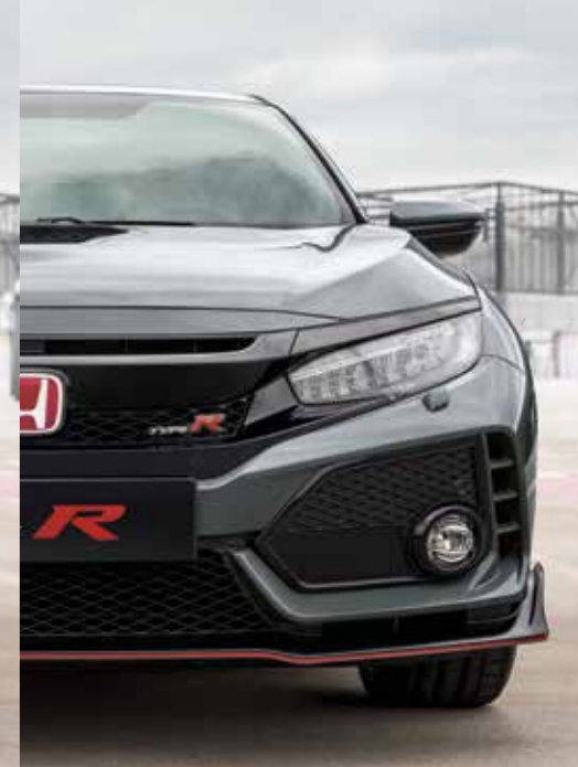
POLISHED METAL METALLIC