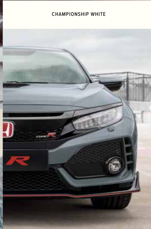
SONIC GREY PEARL