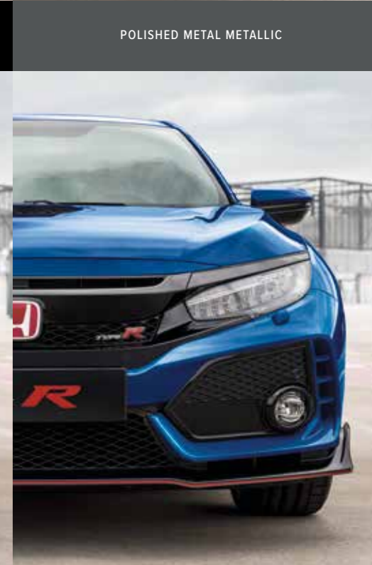
BRILLIANT SPORTY BLUE METALLIC